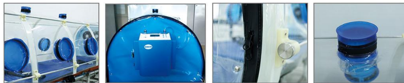
Aluminum support & ABS Poles